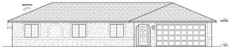
FRONT ELEVATION SCALE = 1/4" = 1'-0"

Amazing housing opportunity located within the City of North Port which is conveniently located between Sarasota and Ft. Myers in SW Florida.